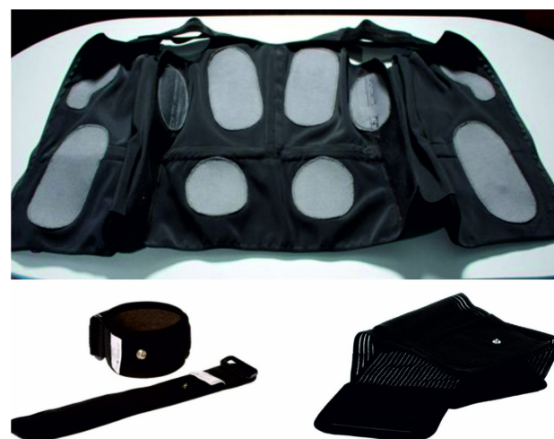
Figure 2 Whole-body electromyostimulation electrodes (vest and sleeves).